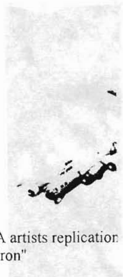
A artists replication Iron"